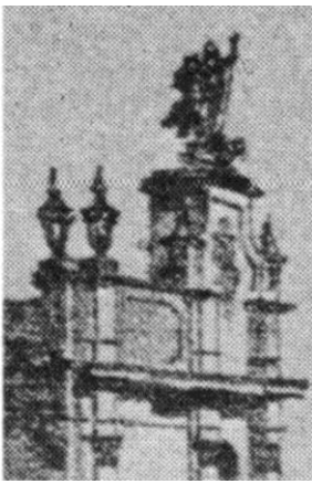
Fig. 1. Fair near St. George's Cathedral (engraving, K. Auer, beg. XIX c.) and stone lanterns on the Cathedral.