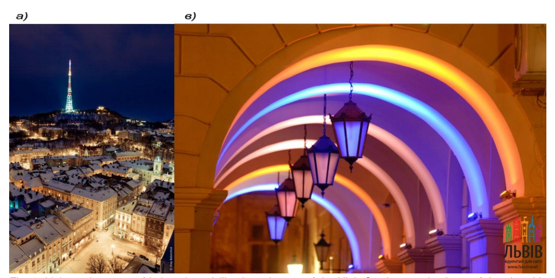
Fig. 8. Light environment of Lviv today: a) illuminated tower of the High Castle as a dominant of the city-wide scale and the utilitarian illumination of the streets; a photo (2013).; b) Local light installation; a photo (2013).

Lviv, it is still possible to meet people who are arranging fire shows in the spirit of the Middle Ages.