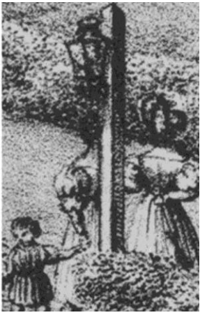
Fig. 3. A view of one part of Lviv (engraving, K. Auer, beg. XIX c.).

Time generates some new weighty reasons for the public formed street lighting to appear: population upsurge and migration to cities and towns; enrichment of merchants