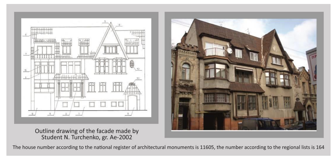
Figure 3: An architectural monument on Darvina St., 29.

along the vertical axis. Even higher are the attic windows that give the building the features of medieval Europe.