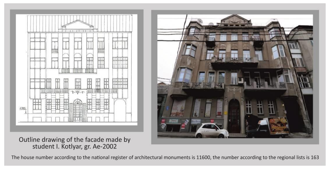
Figure 2: An architectural monument on Darvina St., 15.

Building's apartments are 3m 20 cm high and are quite spacious. Window apertures of considerable size allow to talk about sufficient insolation of premises. The second, third and fourth floors have balconies, forged fences which are made in the style of flowing fluid lines of Art Nouveau. Columns are adorned with sculptures, located near the entrance portal. Furthermore, the upper part above the entrance is adorned with a vase of abundance and garlands of flowers. The building's gable is also decorated with garlands of flowers and sculptures of boys with flowerpots.