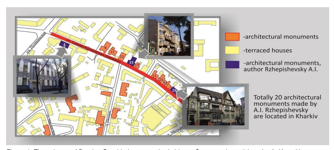
\label{thm:continuous} \mbox{Figure 1: The scheme of Darvina St. with the researched objects. \\ \mbox{Figure 1: The scheme of Darvina St. with the researched objects.}

other side of the street, built in the 30-40 years of the XXth century, has a lawn with trees and buildings located deep, far from the 'red' line. Rzhepishevsky's projects were realized on it in 1912, 1913 and 1915. All the buildings belongs to Art Nouveau style, but they are different in composition and layout. Mastery of the architect was manifested in an individual approach to each of these buildings. It shows how skillfully Rzhepishevsky used a palette of artistic means and techniques of Art Nouveau, masterfully and accurately choosing the necessary solutions for each specific task [17].