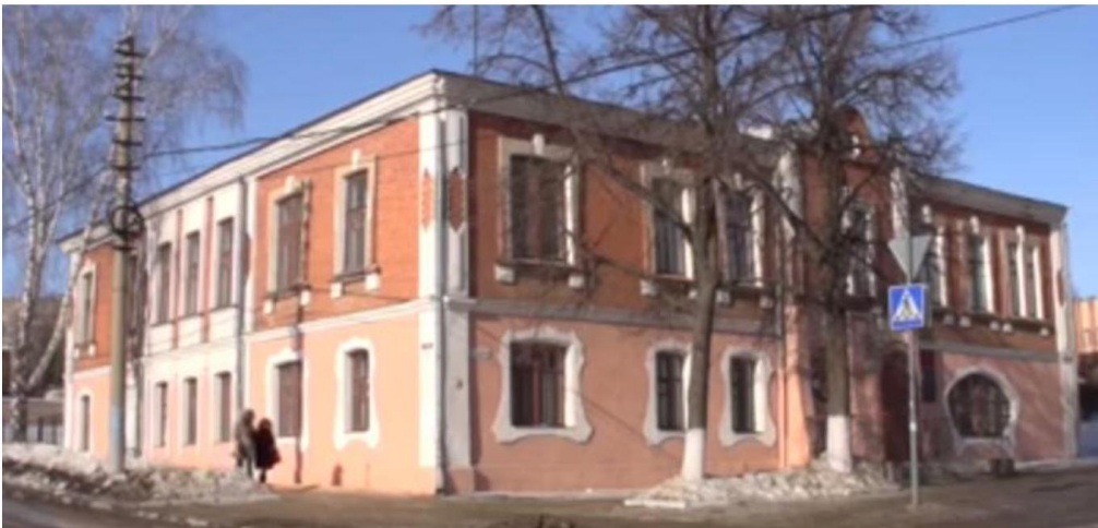
Fig. 3. Children's Music School number 1 of Penza. Source: [15]