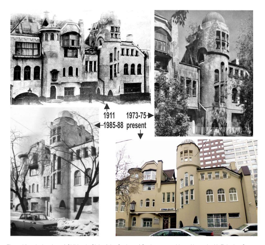
Fig. 2. Historical review of Children's Club of the Society of Settlement, architect Alexander U. Zelenko.

orations, is compared by critics with the works of Gaudi and Hundertwasser (look at fig. 1, fig.2). The Settlement combined the functions of a kindergarten for children of workers, an elementary school, and a vocational school. The license for educational activity was issued personally on "A. V. Zelenko, architect". The students of Setlement were organized in groups of 12 people (boys and girls separately). Each group independently planned the curriculum and produced its own rules of behavior, and in total, up to two hundred children studied in the building. Zelenko and Shatzky were refrained from political activities, but on May 1, 1908, the Settlement was outlawed by the police in connection with the use of children's co-management, in which they saw "the propaganda of socialist ideas" [8].