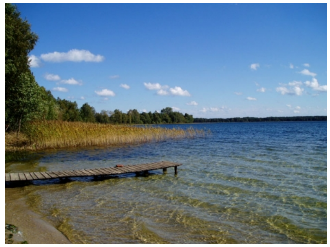
Fig. 1b. Shatsky National Natural Park: on its territory there are more than thirty lakes of varying sizes. Their total area is almost 70 square kilometers. They constitute one of the biggest European groupings of lakes.

Transport infrastructure also affects the urbanization processes, creating the frame of urbanization. The absence of a direct link between agglomeration Drohobych – Truskavets – Boryslav with Sambir is explained by natural factors.