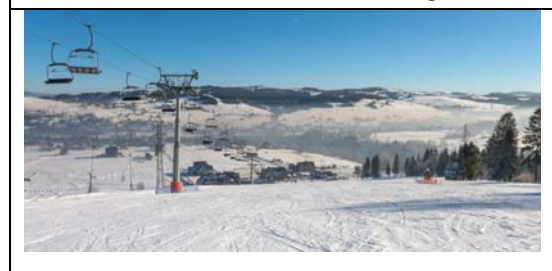
At the level of general visual orientation in the space

Basic geometric characteristics of the forms: prevailing horizontal plane; irregular form of silhouette; forms are located very close to each other and subordinated to the landscape