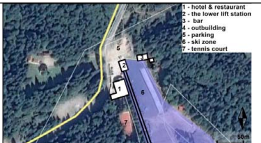
At the level of general visual orientation in the space