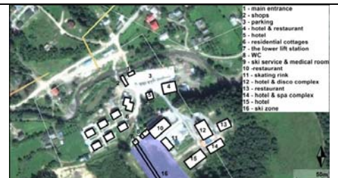
At the level of general visual orientation in the space