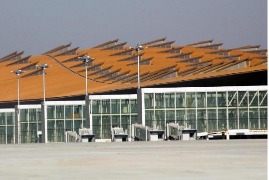
Fig. 2. Skylights on the roof.