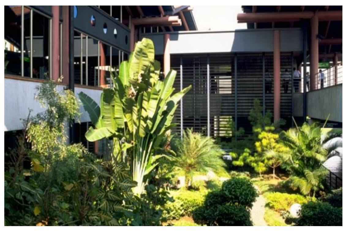
Fig. 7. Landscaping inside the airport.