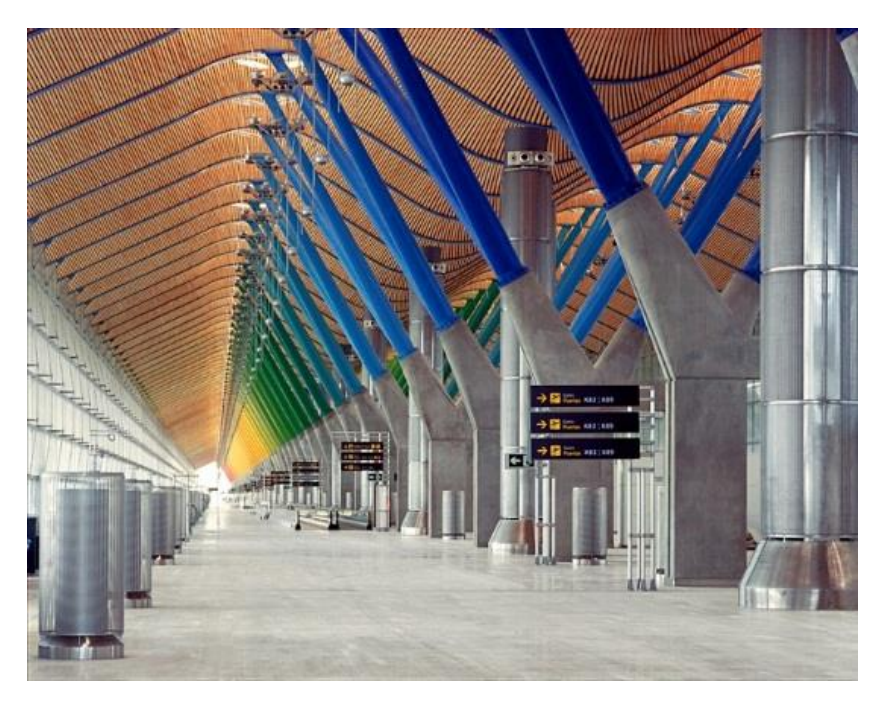
Fig. 9. The Y shape columns inside the airport.

Fig. 8. Madrid– Barajas International. Airport