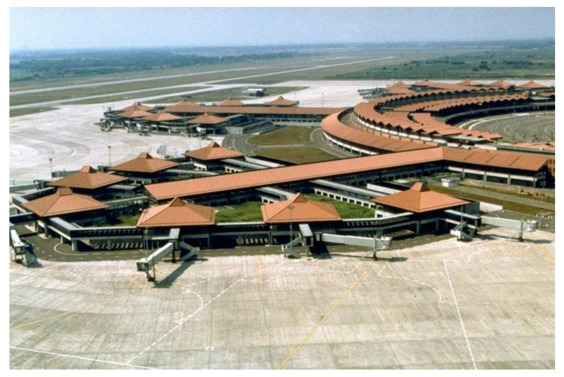
Fig. 6. Jakarta International Airport.