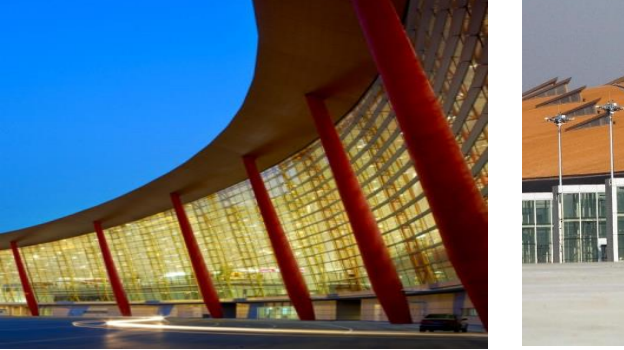
Fig. 1. The red columns on the facades. Source:[4]

The terminal 3 building is located between the eastern runway and the third planned runway and occupied more than 3.1 million square meters. The section plans of terminal buildings show the special form of the roof and dominance of the structure system on the expression of the building to form the terminal as a real gate of the country simulates the local identity and to welcome the visitors of the country with the full energy terminal building which has dragon form and the roof is painted by red in the center and gold in the edges and has southeast-facing skylights enable the sun to warm the building on winter mornings and make the most of natural daylight , the red and gold colors are the traditional colors of the Chinese empire. The physical form of the building contains structural idea that the structural system of the building can be discovered and unveiled by experience and instinct of the human because of the clearance of structural system and its integration with the expressional function.