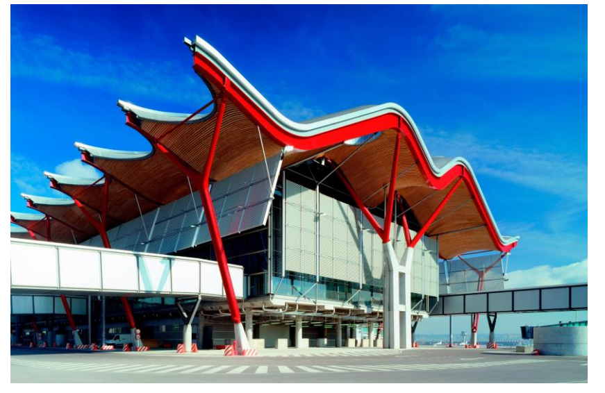
Fig. 8. Madrid– Barajas International. Airport

The airport has four main terminals. The roof of the terminals is formed by 9-meter span curved bridges supported by columns to form like a flying wing, the rood consists of 3 separated metal sections. The main terminal building has 6 layers with different operations and functions, three layers above the ground where the passengers and luggage processes are taking place, the other three underground layers are for the ground transport and maintenance. The underground layers constructed by reinforced concrete unlike the first three layers which have a high transparency. The concrete columns which formed like tree trunks are support points fixed the steal structural system and that can be seen on the facades and in the interior of the building.